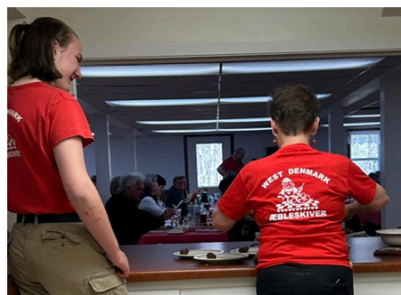
Look for more photos from the Ebleskiver Supper throughout the newsletter!