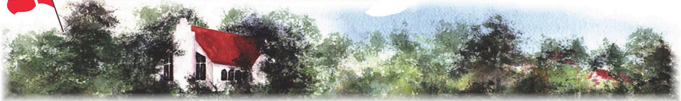
West Denmark Lutheran Church Luck, Wisconsin