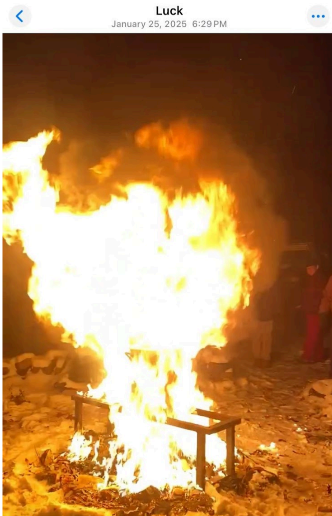
The Fish Boil flames in 2025

As we emerge from nights plunged into the biting cold of -25°C, this winter has brought a particular kind of darkness. I experienced it firsthand when I discovered our blocked sewer pipe, frozen shut, filling my home with an unbearable stench. Thank goodness for Google—it guided me through the process of clearing it. Opening that blocked pipe felt like a breath of fresh air, a little piece of heaven in the midst of chaos.