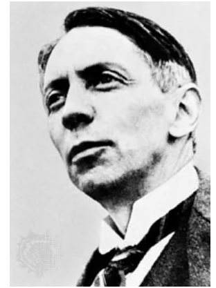
Kaj Munk, 1898-1944: Pastor, Playwright, Martyr